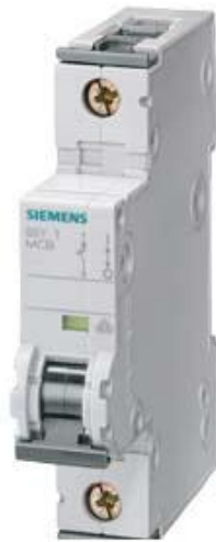
CIRCUIT BREAKER 230/400V 6KA, 1-POLE, C, 4A, D=70MM